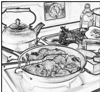
Two digital timers keep elapsed time — even while calculator is in use.