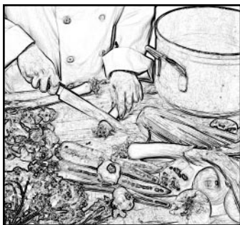
Easily calculate increases or decreases in serving and portion sizes.