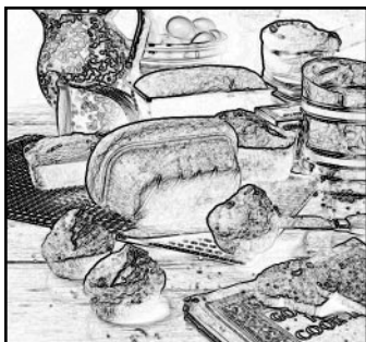
Quickly convert U.S. and Foreign weights, measures and temperatures.